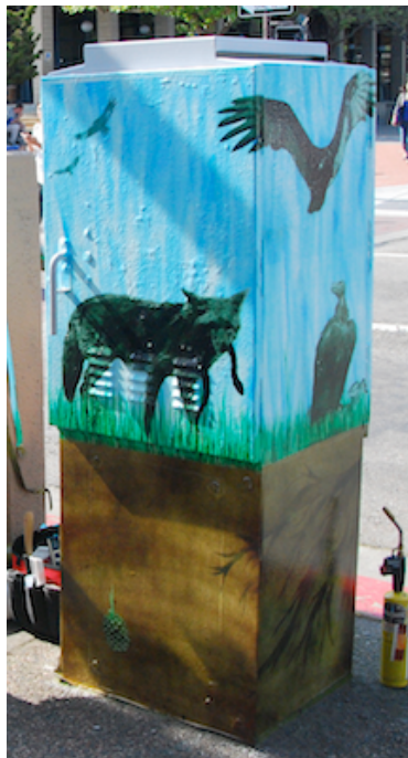
Example of Continuous Image. K. Gravier