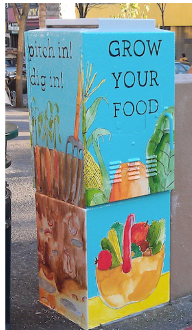
Example of Non-Continuous image. E. Johnson

- Again, do not worry about gaps where doors open. The installer will make the necessary cuts and seams.